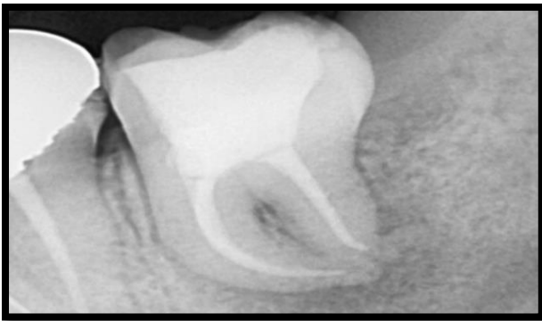
Figure 3 Postoperative radiograph