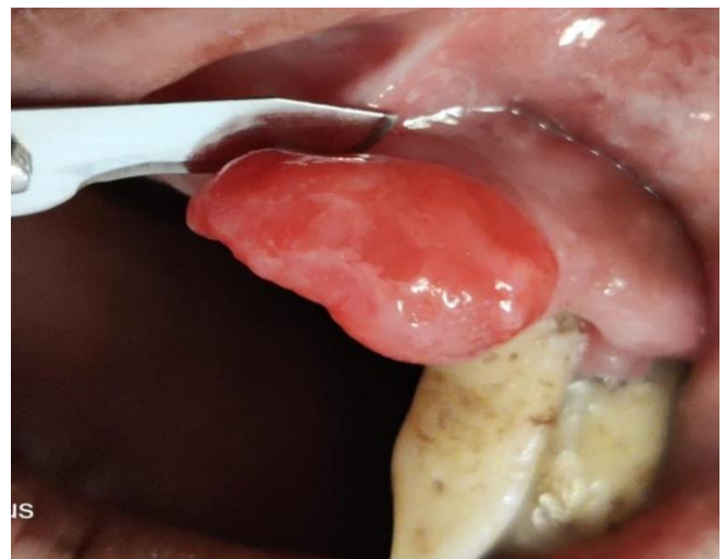
Figure 2 pyogenic granuloma