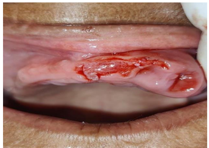
Figure 3 immediate post operative