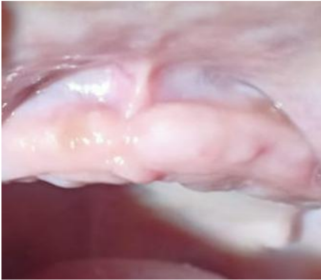
Figure 4 follow up