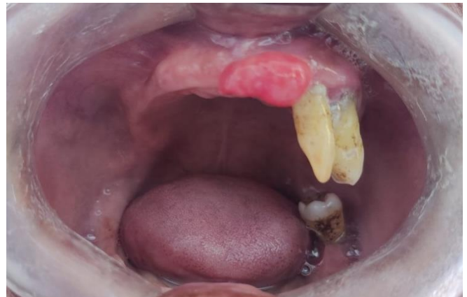
Figure 1 pyogenic granuloma of gingiva

Patient is recalled after 7days, 1 month and 3 month for follow up and no recurrence was found.